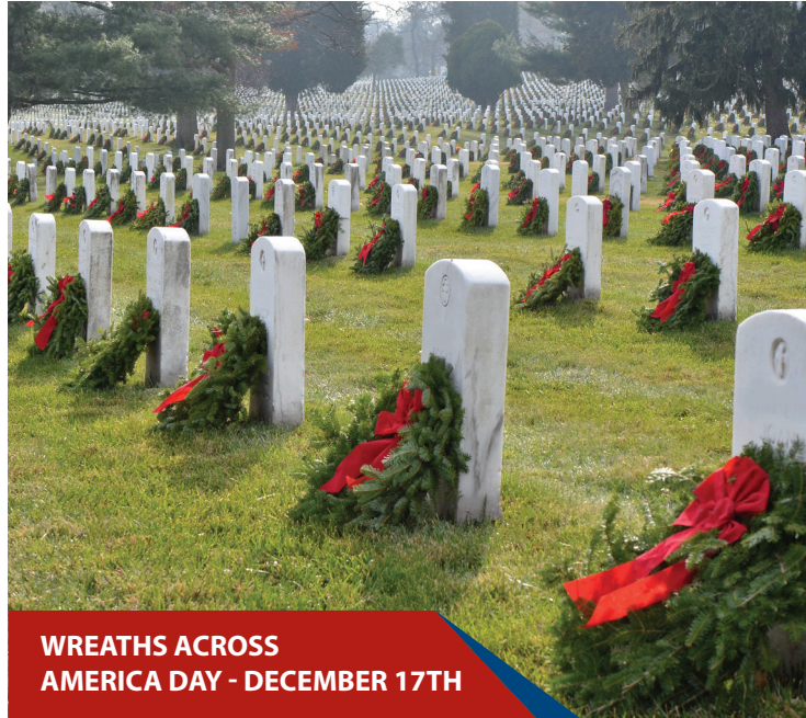
WREATHS ACROSS AMERICA DAY - DECEMBER 17TH

Website: FortSamHoustonFamilyHousing.com