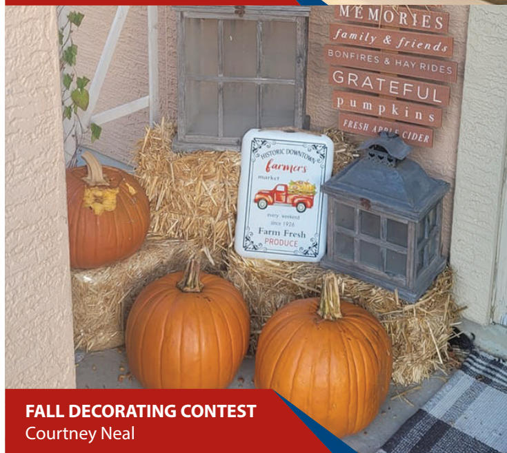
FALL DECORATING CONTEST Courtney Neal