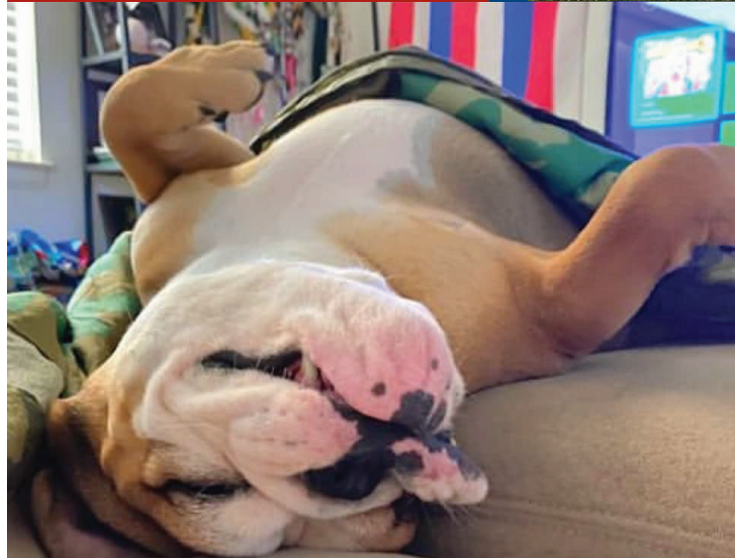
PET OF THE MONTH Dez N Royal Balbag's pup Koa