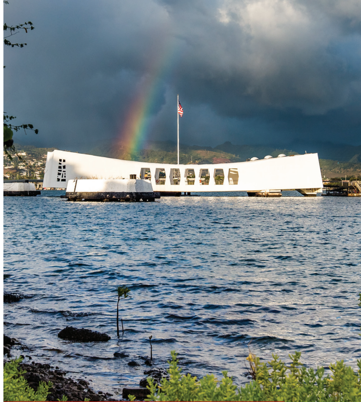
NATIONAL PEARL HARBOR REMEMBRANCE DAY - DECEMBER 7TH

Hunt Offices will be closed January 2nd in observance of New Year's Day. Normal Hours will resume January 3rd.